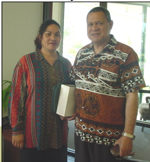
Vice President National Tongan Fellowship